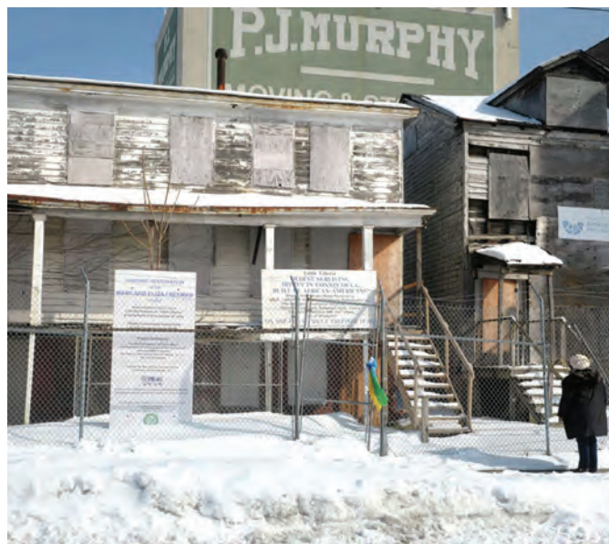
The Mary and Eliza Freeman Houses in Bridgeport, Connecticut, are significant as the last surviving houses of “Little Liberia.” This was a settlement of free African Americans in Bridgeport that began in 1831 and reached its highest population just prior to the outbreak of the Civil War. The Mary and Eliza Freeman Center for History and Community received a $750,000 AACR grant in 2023 for the preservation and rehabilitation of the 1848 Eliza Freeman House.

AACR grants fund a broad range of planning, development, and research projects for historic sites including: survey, inventory, documentation, interpretation, education, architectural services, historic structure reports, preservation plans, and “bricks and mortar” repair. Grant projects are split into two categories: preservation projects and history projects. Preservation project grants are for the repair of historic properties. History project grants are for more interpretive work such as exhibit design or historical research. Since FY 2016, Congress appropriated over $100 million to the AACR Grant Program, supporting documentation, survey, planning, education, interpretation, and bricks and mortar preservation projects. The FY 2020 funding round expanded the scope of the program from projects solely related to the Civil Rights Movement of the 20th century to sites associated with the African American struggle for equal rights from the transatlantic slave trade onwards.