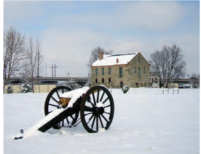
The Great American Outdoors Act (GAOA) Legacy Restoration Fund made possible the necessary funding for preservation work on the historic Commissary Building at Fort Smith National Historic Site. Completed in 1839, it's the oldest standing structure at the park and GAOA funding was critical to restoration and repair work. As of 2022, Fort Smith reported $12 million in deferred maintenance and sustained annual appropriations fulfill cyclic maintenance needs.

Each year, Congress appropriates funds for three principal accounts that help address the maintenance backlog of the NPS. Line-Item Construction funds major rehabilitation and replacement projects that cost $1 million or more. Repair and Rehabilitation projects are large-scale, non-recurring needs that cost less than $1 million and where scheduled maintenance is no longer sufficient. Cyclic Maintenance includes periodically scheduled upkeep and repairs.