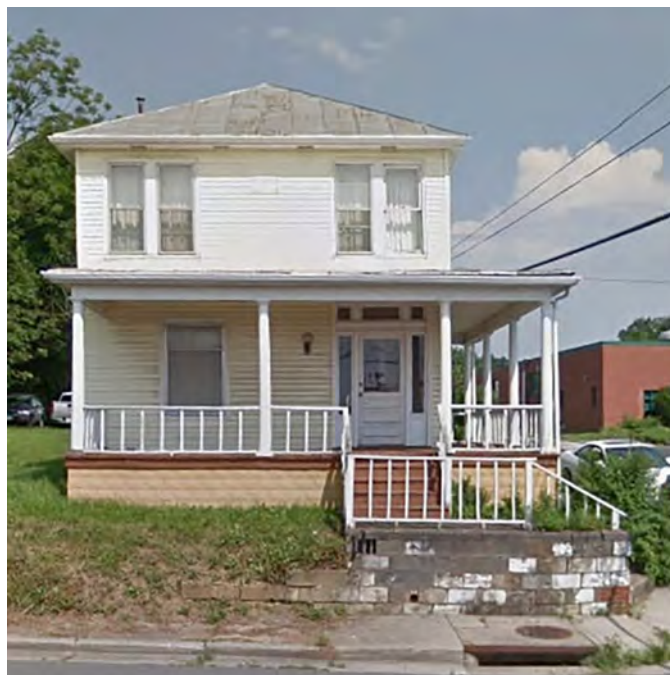
In 2022, the Shenandoah Valley Black Heritage Project was awarded an NEH grant, administered by the National Trust for Historic Preservation, for the development of several self-guided walking tours exploring African American history in the Shenandoah Valley of Virginia. This site is included in the Harrisonburg, Virginia walking tour.

The NEA provides Americans in every congressional district the opportunity to experience and participate in the arts. Since 1965, NEA has awarded more than $5.5 billion in grants, which have been distributed in all fifty states. Each dollar of federal investment leverages up to $9 in private and other public funds. The NEH has distributed more than $5.6 billion through more than 64,000 grants for education, research, preservation, and other public programs in the humanities.