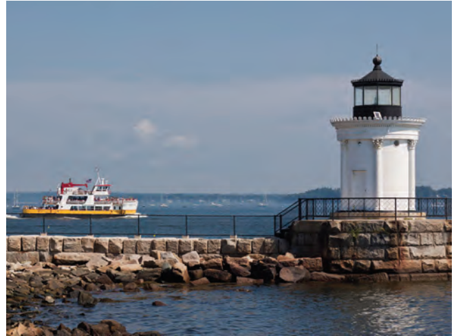
Portland Breakwater Light in Maine was built in 1875 and was modeled on an ancient Greek monument, built with plates of cast iron. It was nicknamed “Bug Light” due to its small size.