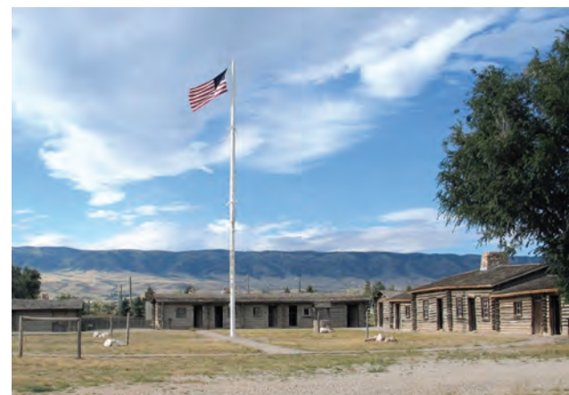
The City of Casper, Wyoming and the Fort Caspar Museum were awarded a Save America's Treasures grant in 2023 for preservation and rehabilitation work on the site's historic log buildings, which date to 1865.

Authorization for the HPF expired in September 2023. The HPF should receive the support and certainty needed to adequately protect our nation's historic resources well into the future.