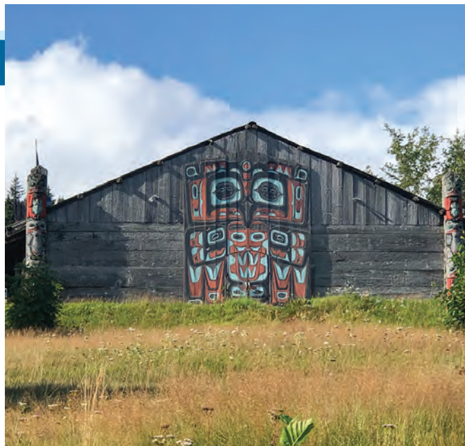
Noow Hít is the last surviving example of Lingít vernacular architecture in Haines, Alaska. It was started in 1959 and dedicated August 11, 1962, to preserve knowledge of traditional construction techniques as part of the Alaska Indian Arts, Inc. carving program. The construction was guided by Lingít elders who had lived in traditional tribal houses in the late 1800s. In 2023, the Chilkoot Indian Association received a Save America's Treasures grant for the stabilization and rehabilitation of the Noow Hít tribal house.

In 1998, President Clinton issued an Executive Order creating the Save America's Treasures Program, providing funding both for preservation projects and collections work. The National Park Service administers the program in partnership with the Institute of Museum and Library Services, the National Endowment for the Humanities, and the National Endowment for the Arts. Unlike many other federal competitive grant programs, the SAT program requires dollar-for-dollar private matching funds. After lapsing in FY 2011, Congress renewed its commitment to the SAT program in FY 2017. In the program's history, more than 1,300 grants have been awarded totaling over $300 million in projects across the United States. Roughly 65% of the recently awarded funding has gone to bricks and mortar, job-creating projects.