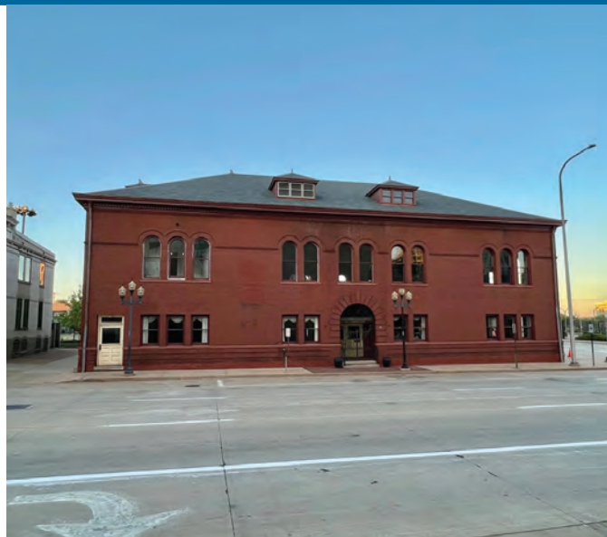
The Peoria Women's Club's (PWC) Clubhouse, built in 1853, has been the headquarters of the PWC for over 130 years. The PWC had a significant role in the 1910s suffrage movement, serving as a hub for the Peoria Equal Suffrage Association, hosting voter education classes and advocating for equal voting rights.

HER grants fund a broad range of preservation projects for historic sites, including architectural services, historic structure reports, preservation plans, and physical preservation of structures. The first round of recipients was announced in June 2021. Sites are eligible for this grant if they are listed in or determined eligible for the National Register of Historic Places or as a National Historic Landmark. Should a site not be listed, or not listed for its association with equal rights, then a new nomination or amendment must be created as part of the grant project. Grants under this program are awarded through a competitive process and do not require non-Federal match.