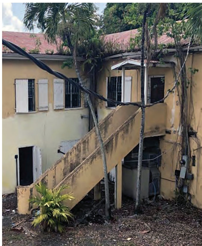
The Old Barracks Property on St. Croix, U.S. Virgin Islands, housed the U.S. Navy, who administered the islands until 1927. The building was later converted into the first and only public high school on the island, which operated until 1967. Hurricane Hugo severely damaged the building in 1989, which led to its eventual abandonment. An FY 2022 Save America's Treasures grant will fund roof repair, drainage issues, and hazardous material abatement. It is the first SAT grant to the U.S. Virgin Islands.

The SAT grant program's completed restoration and preservation projects include Martin Luther King's Ebenezer Baptist Church and the iconic Star-Spangled Banner that flew above Fort McHenry during the War of 1812 and now hangs in the Smithsonian National Museum of American History. Many diverse sites and stories have also benefited from the funding opportunities provided by the SAT grant program, including the poems carved by Chinese immigrants into the walls of Angel Island; Mesa Verde's cliff dwellings and associated collections of Native American artifacts; the complex at Fort Snelling; and the Harriet Tubman House in Auburn, NY.