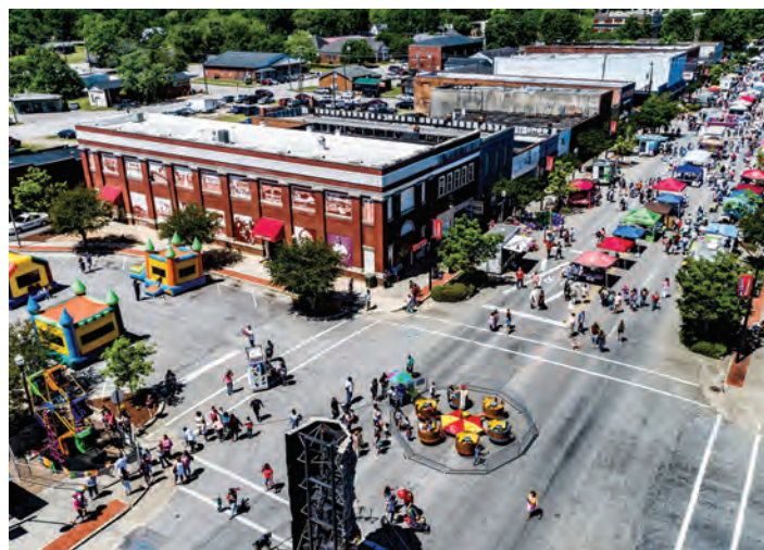
The Dillon Community Alliance in Dillon, South Carolina received a $750,000 Paul Bruhn Historic Revitalization Grant in FY 2022 for the stabilization of commercial historic district buildings. This is the first Paul Bruhn grant issued in the state of South Carolina.