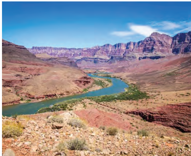
The Zuni THPO provides annual reports to the Glen Canyon Dam Adaptive Management Program as they monitor the flow of the Colorado River water through the Grand Canyon. The Glen Canyon Dam alters the flow of the river, thus eroding sacred sites and ancestral places.