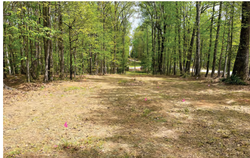
Established circa 1828, Pierce Chapel African Cemetery in Midland, Georgia is one of the oldest burial grounds for Africans enslaved at Harris County, Georgia plantations and is estimated to have up to 500 burials at the 2-acre site. It was named as one of America's 11 Most Endangered Historic Places of 2023.

For more than five years, advocates urged Congress to pass legislation that protects and preserves historic African American cemeteries. This recently authorized program will allow descendant-led and preservation organizations working to protect African American burial grounds to receive funding to preserve these sacred landscapes. Assisting with the discovery of these places of tribute and memory ahead of commercial development will help avoid disturbances of these sacred places and aid family members, descendants, and community members in honoring and remembering their shared past.