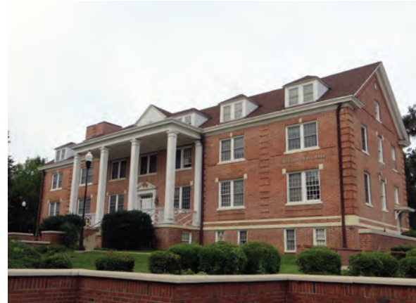
Jackson Davis Hall, constructed in 1927, is a historic Georgian Revival building in the heart of Florida A&M University's campus. It is one of 14 projects in 10 states to receive funding from the HBCU grant program in FY 2023.

Since Reconstruction, Historically Black Colleges and Universities (HBCUs) have provided African Americans with greater access to higher education and told the story of the struggle for social justice. The historic buildings and landscapes on HBCU campuses—many of which were built and designed by African American architects, planners, and students—hold a diverse and empowering collection of stories and artifacts that help tell the full American story and reflect the important legacy of the African American educational experience and communities that surround and support these institutions.