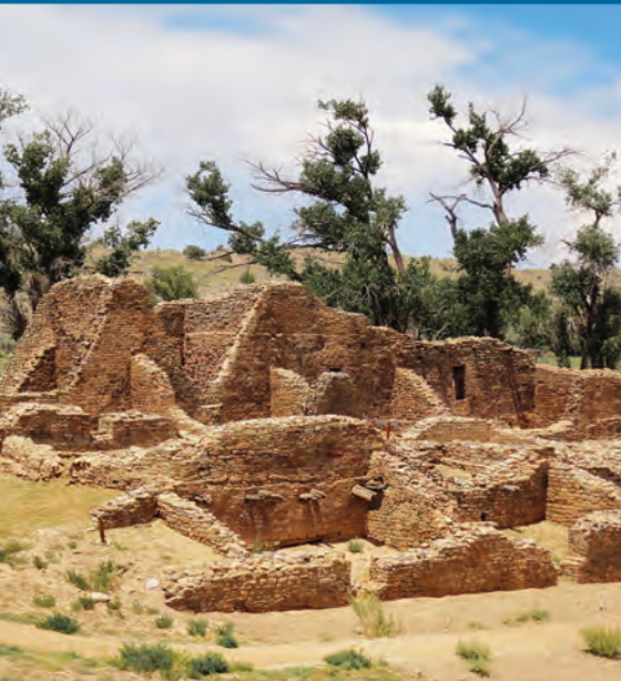
The Aztec Ruins in New Mexico were first designated as a National Monument in 1923 by President Harding, and were also named a World Heritage Site in 1987. The image shows the central room block of Aztec Ruins National Monument. This project will update the listings for 3 sites, Chaco Culture National Historical Park, Salmon Ruins, and Aztec Ruins National Monument to include Zuni significance